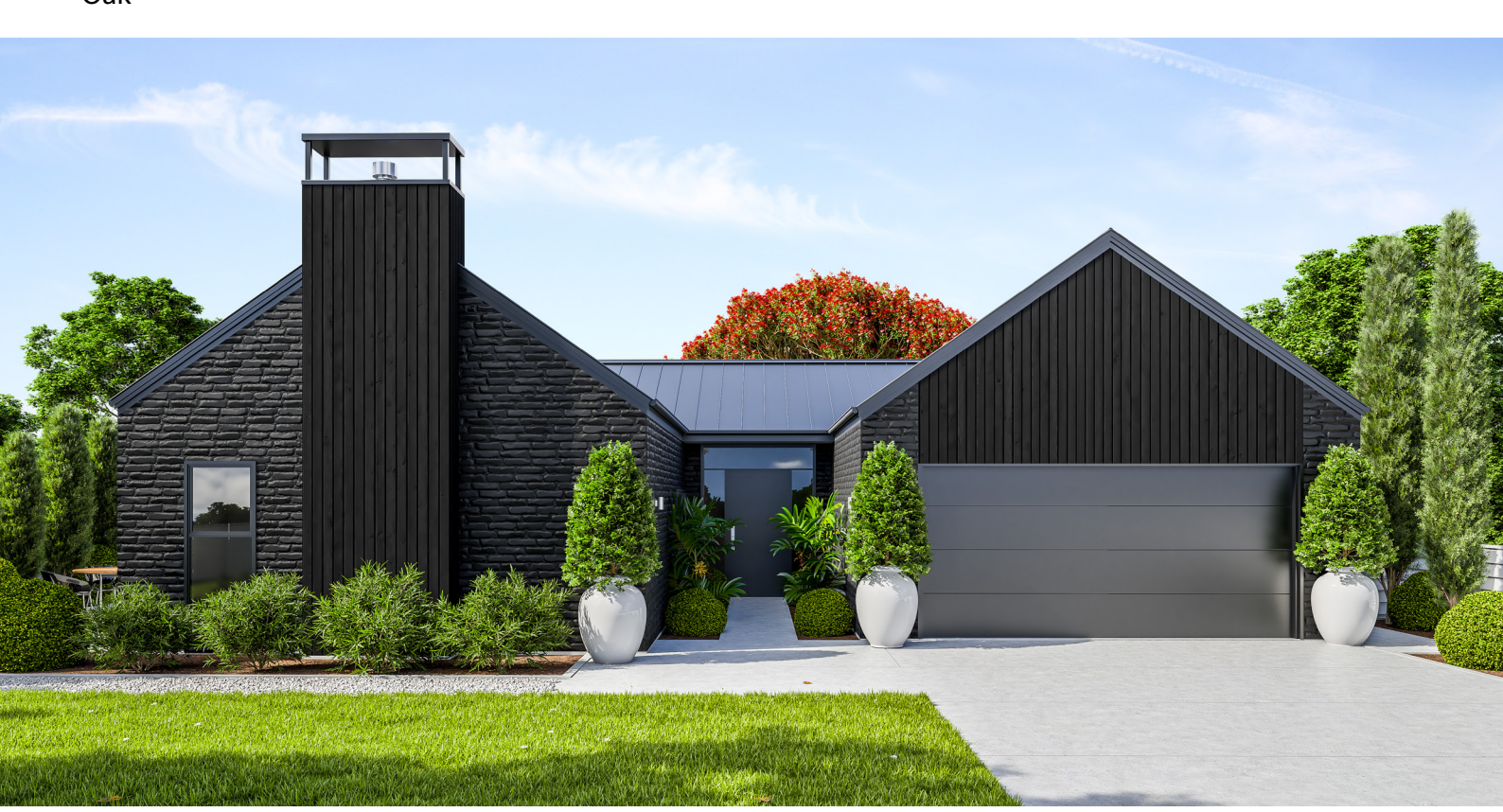
Two gables, two claddings and an entranceway framed perfectly by the home, this is a car stopper! Urban or rural, this build has a timeless vibe! Covered outdoor living comes with additional access straight from the scullery, perfect for serving food and drinks. If you're looking to have it all, this is a great start!